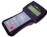
PWHY280 Simple remote control with Display/ Control remoto simple con visor