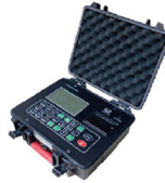
PWHY680 Remote control with printer and display/ Control remoto con impresora y visor