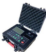
PWHY680 Control remoto con impresora y visor / Remote control with printer and display