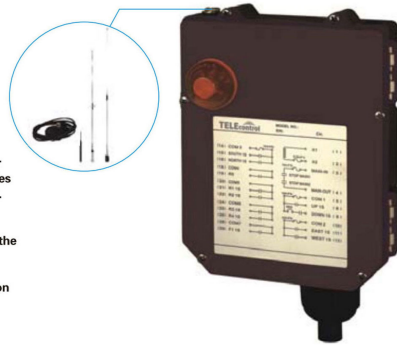
MODEL: EF24-RXC ITEM CODE: 924-100-103 Dimension: 210x162x107mm Weight: 1220g