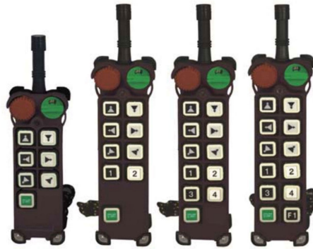
EF24-6S/D EF24-8S/D EF24-10S/D EF24-12S/D

MODEL: EF24-TX ITEM CODE: 924-400-001 Dimension: 186 x 61 x 51 mm Weight: 280g (without batteries)